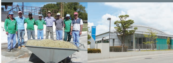
AGRO PECUARIA YKK LTDA.